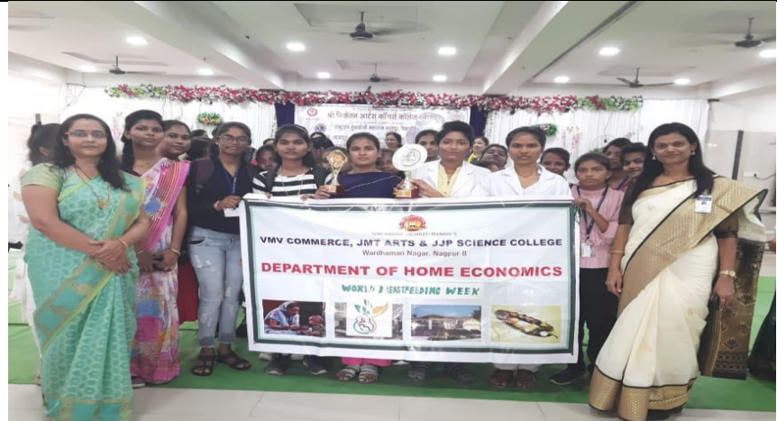
Guest Lecture on Importance of Balanced Diet and Nutrition (24 Sept 2022)