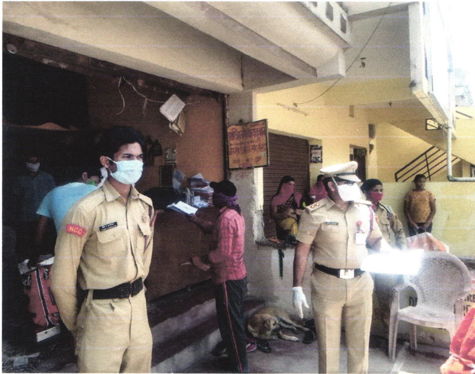
Ensuring the Measures of COVID-19