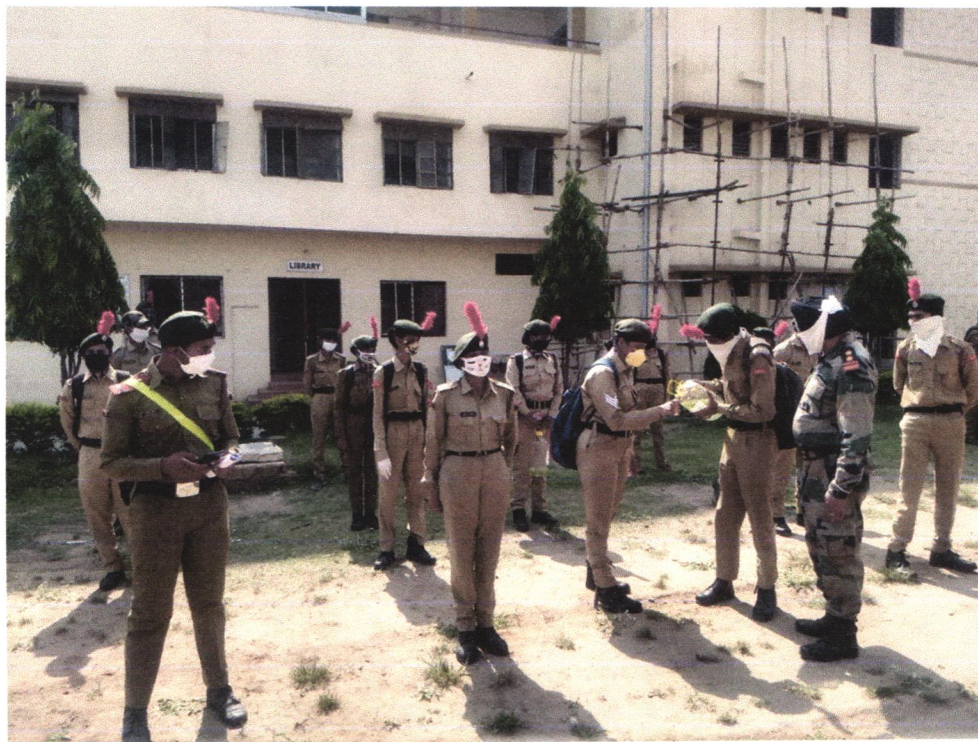
Distributing Mask and Sanitizer to Cadets - PI Staff of NCC Unit