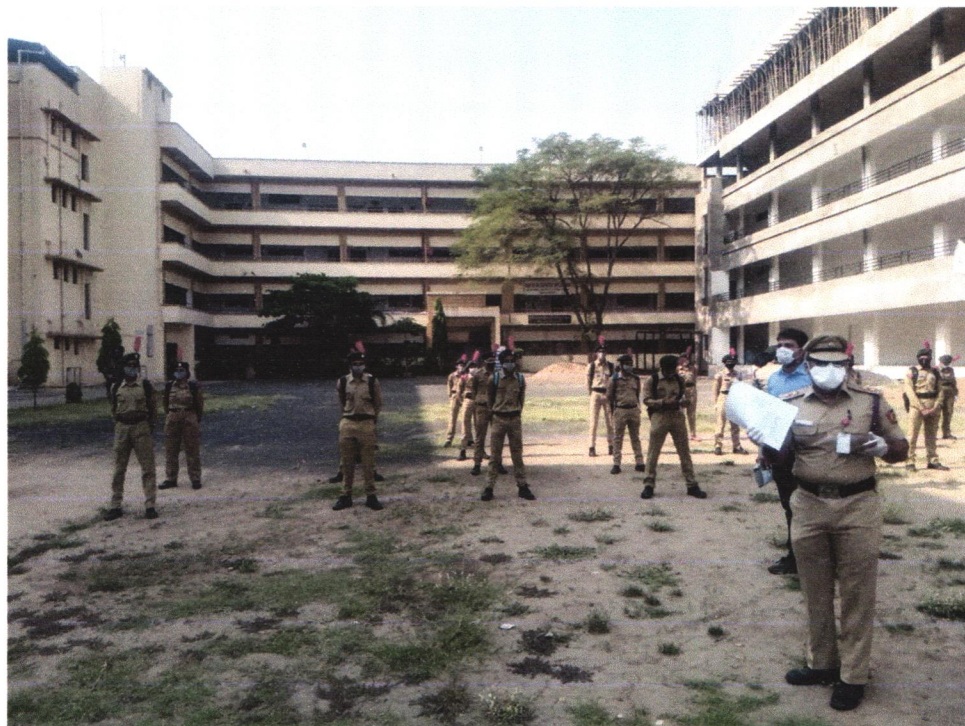
Commencement of Activity and Briefing By NCC Officer to Cadets